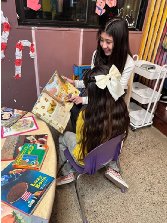
Reading Program at OC Rescue Mission