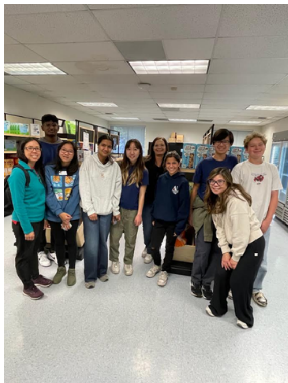
IVC Food Pantry