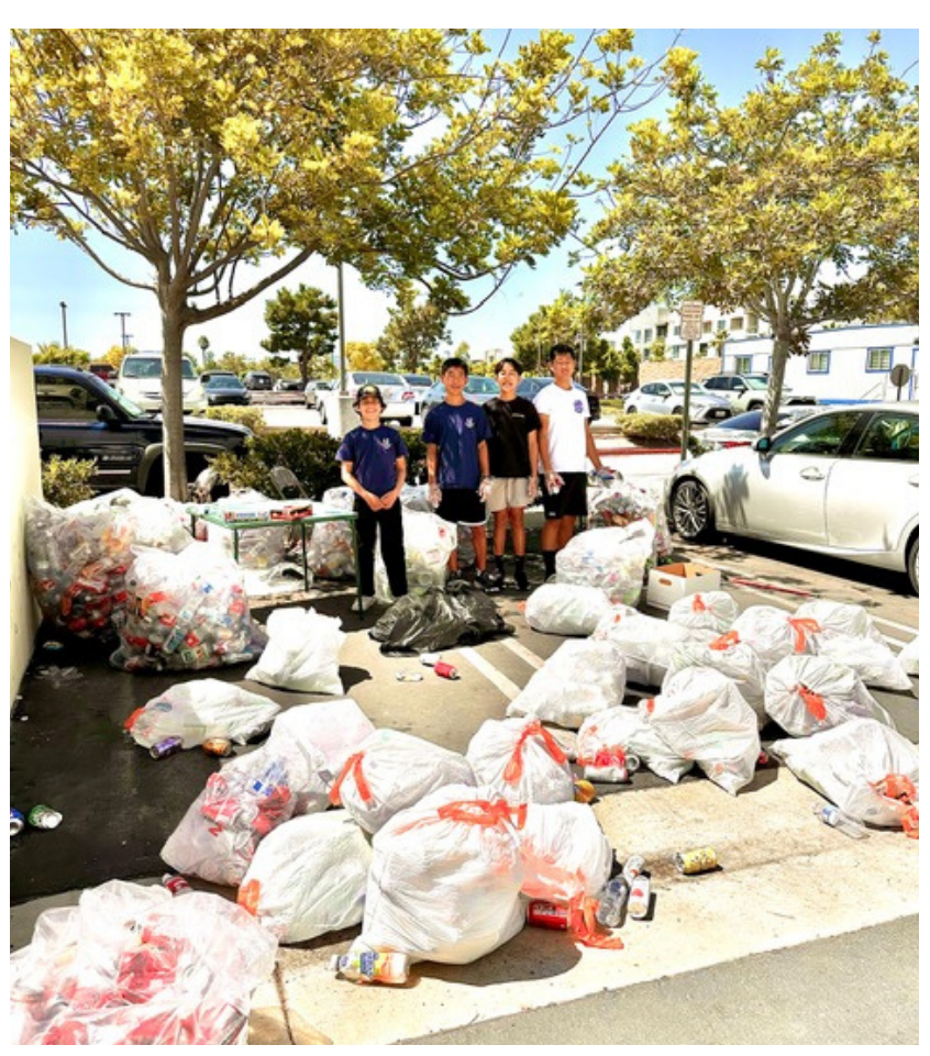
Recycling raised over $188!