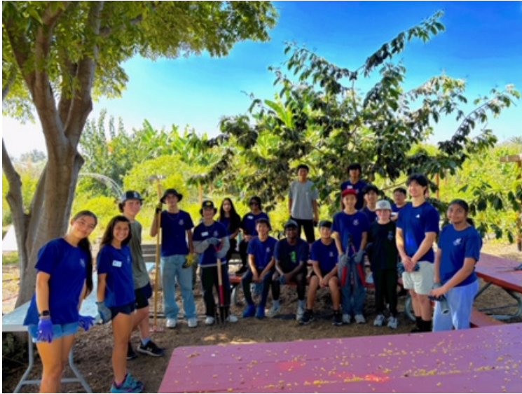
Farm & Food Lab